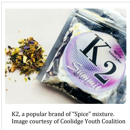
K2, a popular brand of “Spice” mixture.

Some Spice products are sold as “incense,” but they more closely resemble potpourri. Like marijuana, Spice is abused mainly by smoking. Sometimes Spice is mixed with marijuana or is prepared as an herbal infusion for drinking.